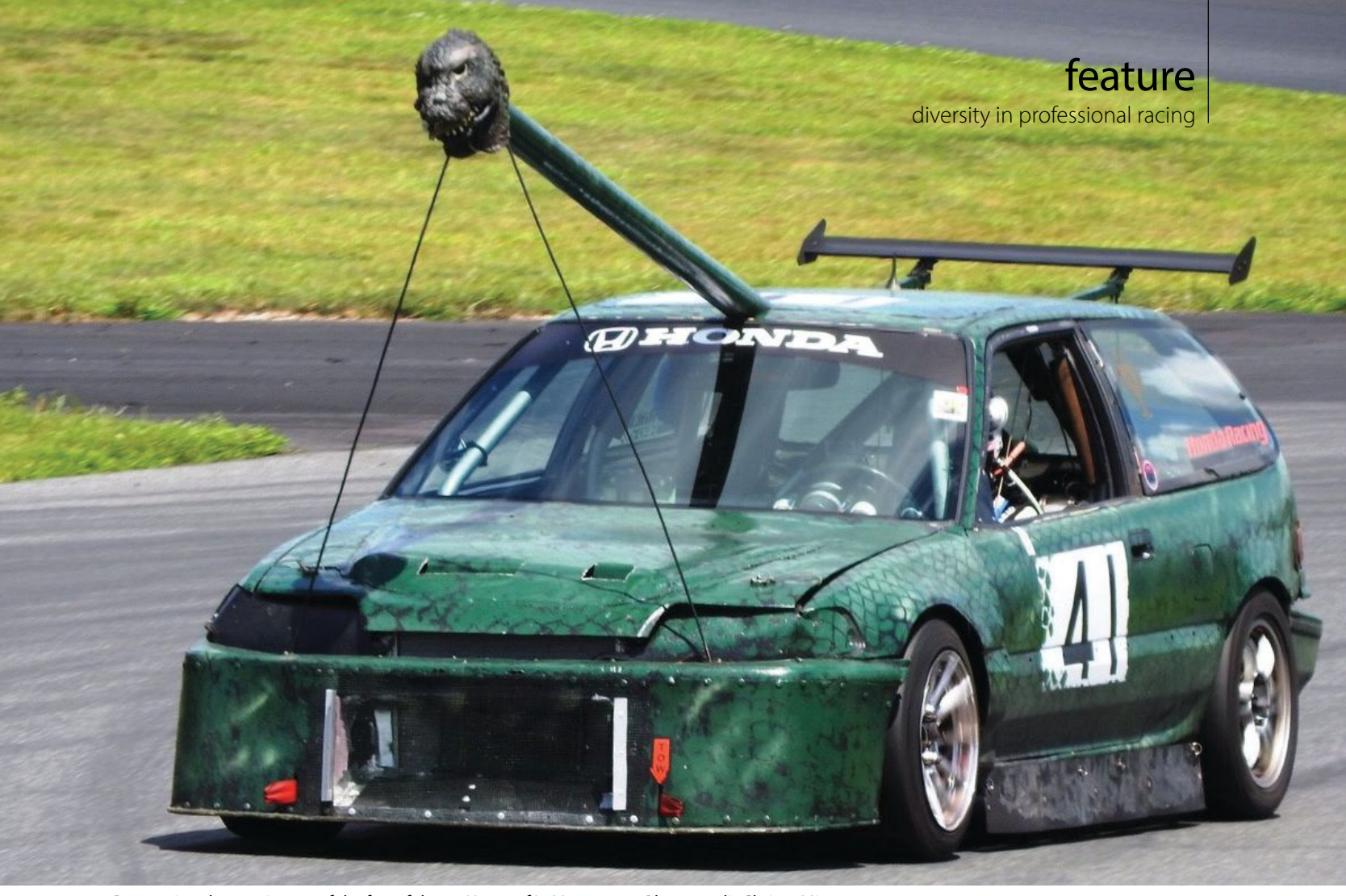
Decorating the cars is part of the fun of the 24 Hours of LeMons races.

getting sponsorships is difficult, even for men. Despite this challenge, she likes breaking barriers and proving people wrong.